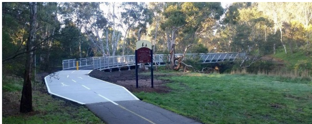
Riders in Melbourne's north gained another new bridge this week. The bridge over Darebin Creek near Dundas Street is a great improvement on the older one it replaces and was a joint venture of Darebin and Banyule councils. Along with the spectacular new bridges linking the Darebin Creek Trail to the Main Yarra Trail in Kew, it increases the options for excellent off-road training rides and improves access from the northern suburbs to the Main Yarra Trail and Yarra Boulevard.

Please read on also for a good crop of notes from the Club Committee and a round of social notes from Mark Edwards, mostly about the many things that should be on your radar now that spring and daylight saving are just around the corner.